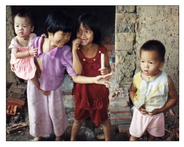
In Indonesia 40,000 children go blind each year from lack of Vitamin A.